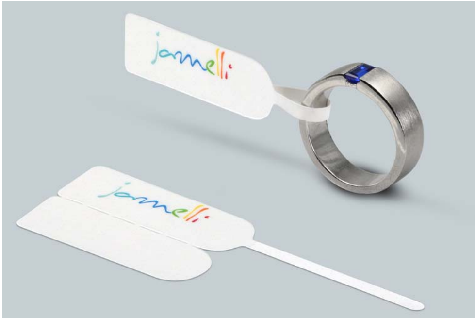
Img.3: Labels with loop, individual shape, with digital logo print in 4 colours from eXtra4 Labelling Systems