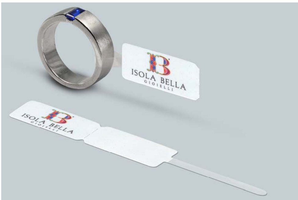
Img.2: Jewellery Labels with transparent loop, digitally printed with 4-colour design at eXtra4 Labelling Systems