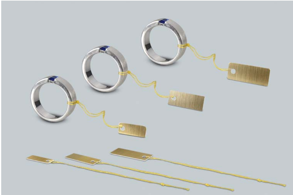
Fig. 3: Labels with thread for hand inscription in rigid PVC, gold metallic, in 3 sizes: 13.5 x 5 mm (Type 71 78A COZ), 17 x 7 mm (Type 71 65A COZ) and 20 x 8.5 mm (Type 71 764A COZ) with ochre thread, length 7 cm.