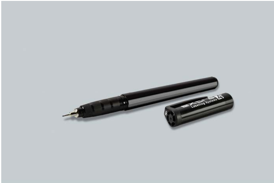
Fig.1: Ideal for marking labels by hand: permanent marker 81 PM2, line width 0.3 mm, black, non-smear and water resistant