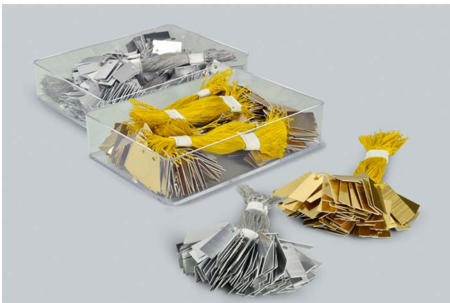
Fig.2: Label with loop for hand inscription in brushed rigid PVC, gold metallic with ochre coloured thread, silver metallic with grey thread, 500 pieces, bundled in 100 pieces, in clear box