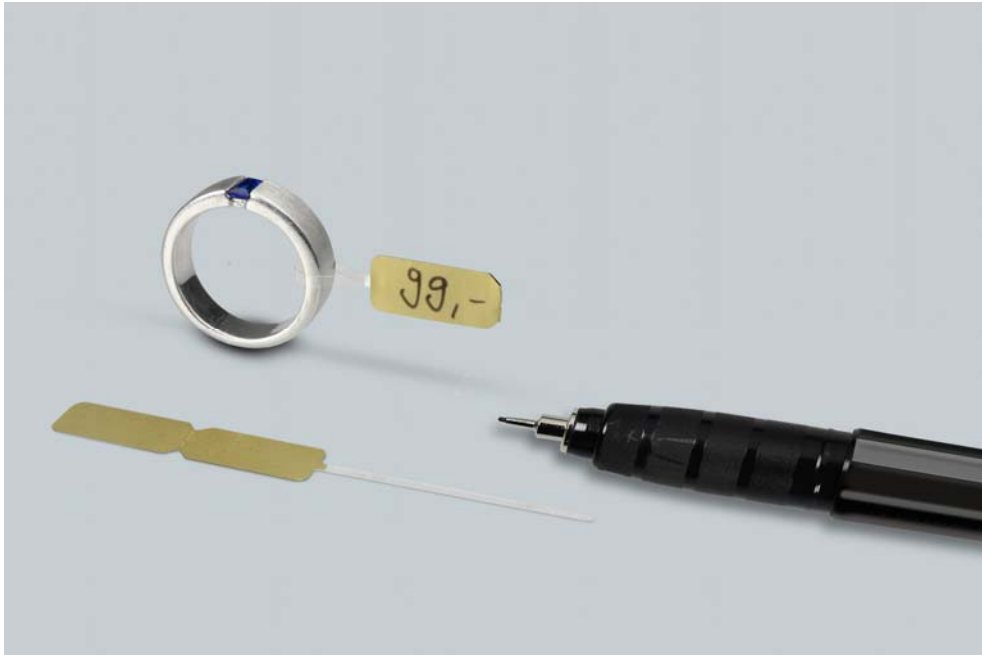
Fig.5: Self-adhesive metallic labels 44 870 XHB for hand inscription, with transparent, non-glued loop