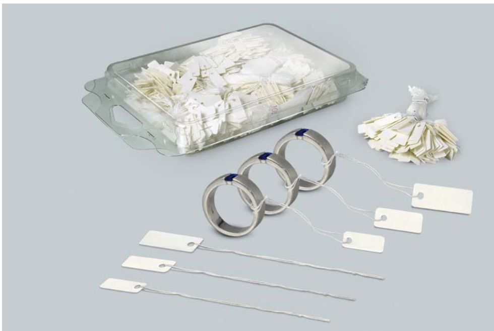
Fig. 4: Labels with thread for manual inscription 71 78A KWW, 71 65A KWW, 71764A KWW made of white cardboard with white thread, bundled in 100 pieces, each 1000 pieces in re-closable blister pack