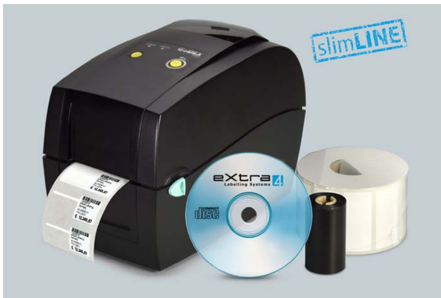
Img. 4: "slimLINE" starter package with Godex RT200 label printer, eXtra4 label printing software, jewellery labels and carbon ribbon