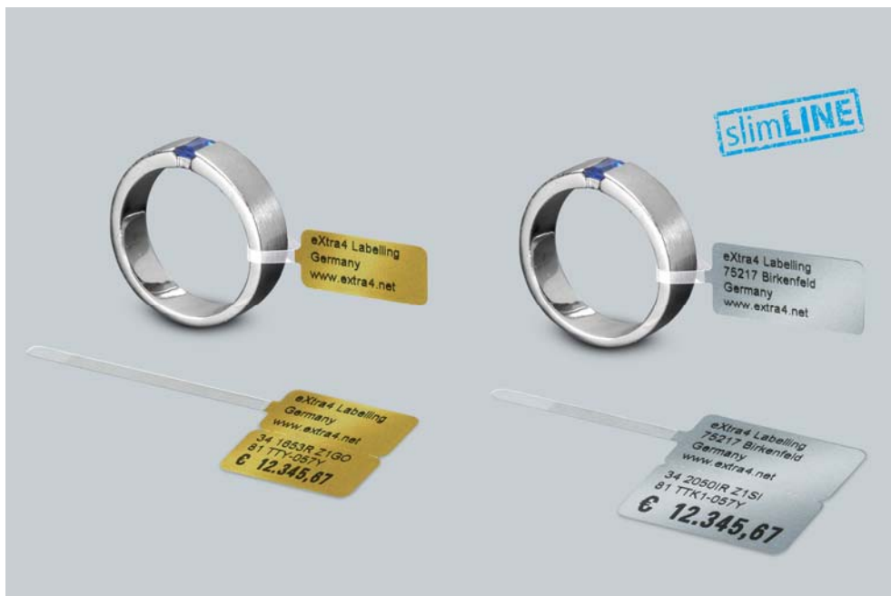
Img.2: "slimLINE" jewellery labels with transparent loop in gold metallic, size, Small, ref. 34 1653R Z1GO and silver metallic, size Standard, ref. 34 2050IR Z1SI, printed with the "slimLINE" Godex RT230 printer, 300 dpi.